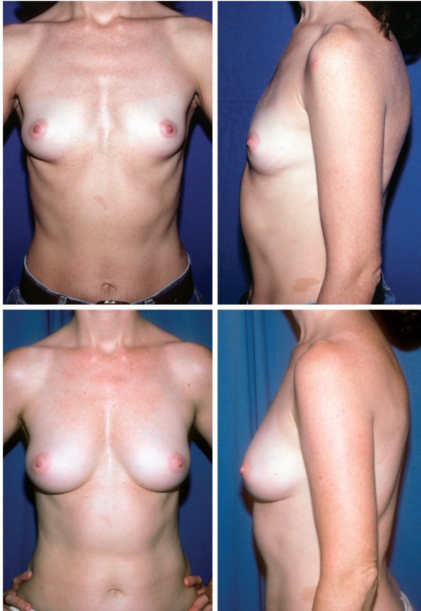
Fig. 1. (Above) Preoperative views of a 32 year-old woman with a complaint of micro-mastia. (Below) Postoperative views 7 years after one fat grafting procedure, with 245 cc grafted into the left breast and 190 cc into the right breast.

months) and reported having lasting, favorable results. The remaining 13 patients were followed in the office for a minimum of 10 months, with a mean follow-up of 62.2 months. All patients were pleased with their postoperative results, had a noticeable change in size, and had an improvement in the contour of their breasts. Of the patients who returned for photographic comparisons, all showed an enlargement of their breasts and improvement in the surface